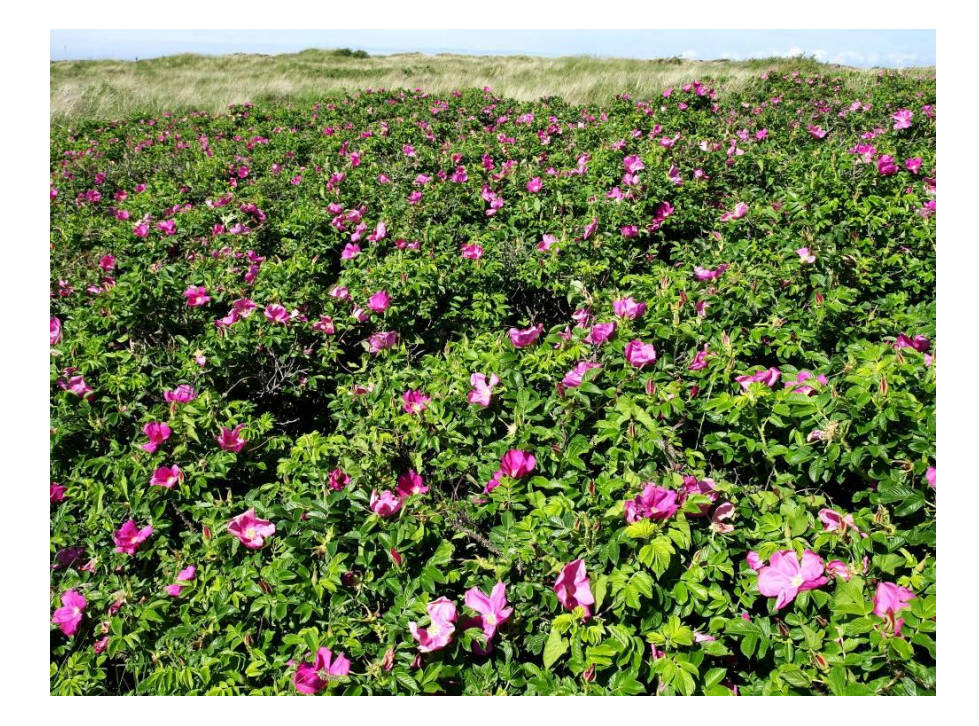
Figure 2. Large patch of R. rugosa , Hightown sand dunes, June 2008

seawater. Both hips and achenes are buoyant and can float for several weeks, occurrences on uninhabited Scandinavian islands being thought to be due to maritime dispersal (Weidema, 2006). However, once established the main mechanism of spread is through vegetative reproduction via suckers (Bruun, 2005; Weidema, 2006).