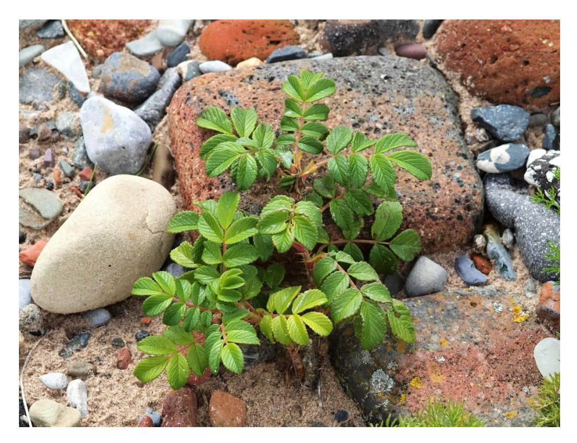
Figure 8. Seedling R. rugosa on Hightown brick rubble "shingle", July 2014, following a storm-surge

The relative absence of patches in the central section of the Sefton coast is readily explained by the fact that a 5 km stretch around Formby Point has been subject to coastal erosion at an average rate of about 4 m per annum for over 100 years (Smith, 2009). Thus, the frontal dune habitat in which R. rugosa would normally become established has been regularly washed away.