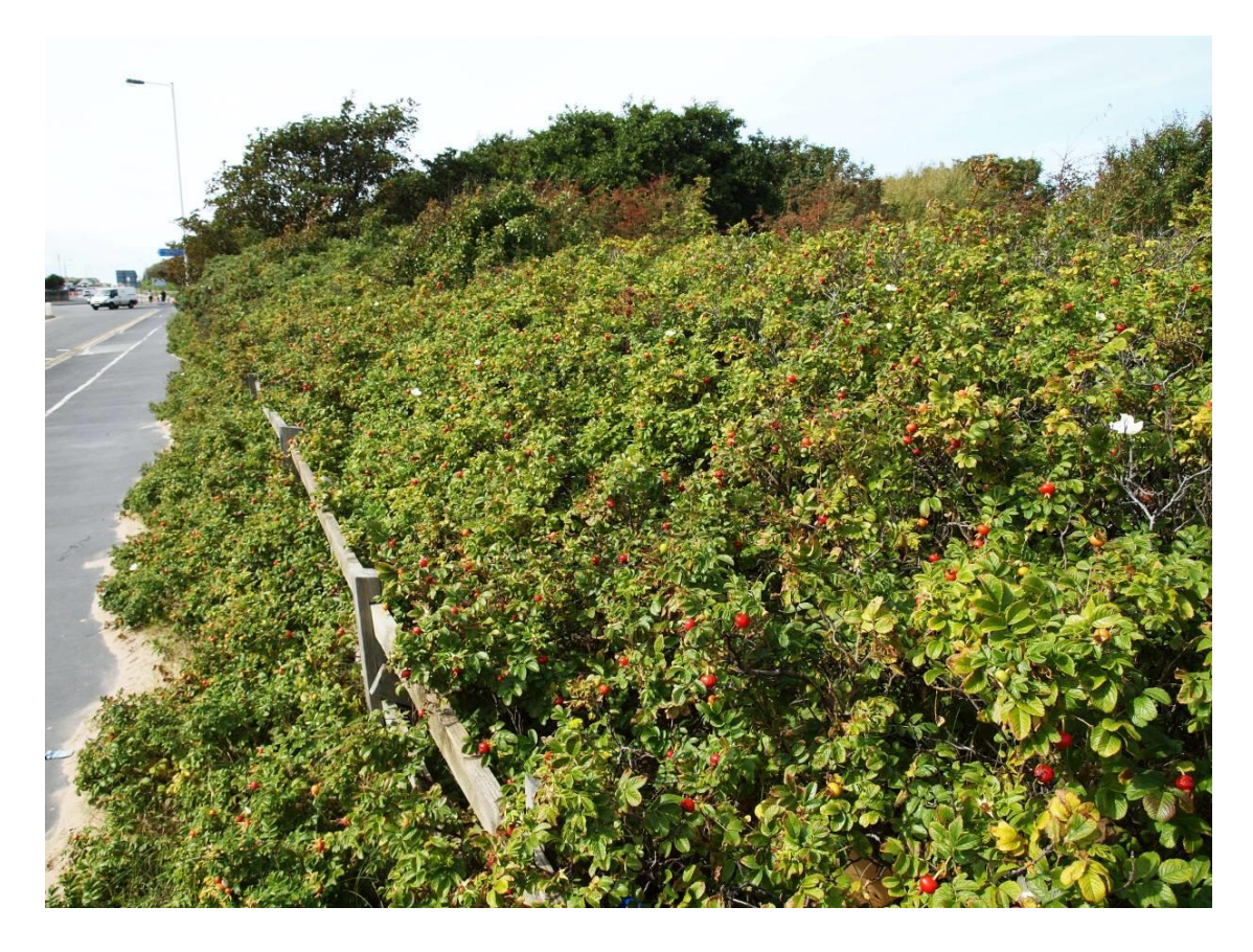
Figure 9. Large patch of R. rugosa at Shore Road, Ainsdale, August 2014

Having an Ellenberg F value of 3, R. rugosa is regarded as a dry-site indicator (Hill et al. , 2004). However, the presence of numerous patches associated with Alnus seepage zones on the eastern edge of Birkdale Green Beach shows that the plant can tolerate occasional water-logging.