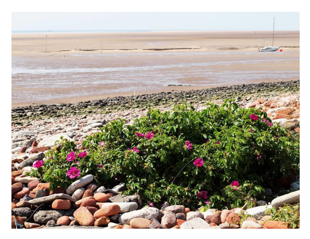
Figure 6. R. rugosa on brick rubble "shingle" at Hightown, June 2015