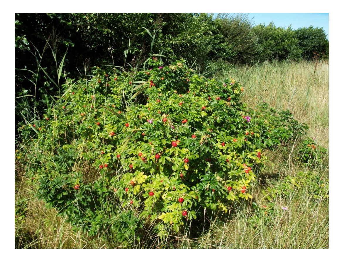
Figure 5. R. rugosa growing with Alnus glutinosa , Birkdale Green Beach, August 2014

It should be noted that 60 patches (12%) were not ascribed a habitat on the recording forms and are therefore excluded from this analysis. Fixed-dunes were the preferred habitat for R. rugosa , supporting 38% of patches, followed by semi-fixed dunes (21%), while dune-scrub/woodland fringe held 13% of patches. Habitats little favoured by the plant included mobile dune (3%) and dune-slack (0.5%). The transition between saltmarsh and terrestrial habitat at Marshside on the Ribble Estuary supported 4% of patches, while 15% were found on the fringe of Alnus glutinosa (Alder) woodland along a seepage zone on the eastern edge of Birkdale Green Beach (Fig. 5). A weathered brick rubble embankment between Hall Road and Hightown held 6% of the patches (Fig. 6).