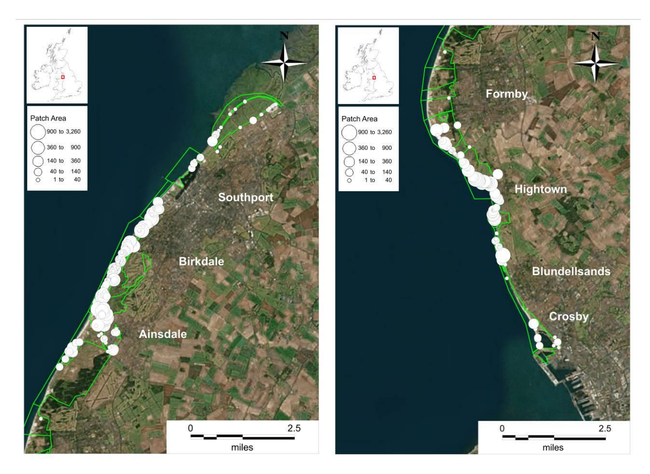
Figure 3. Distribution of Rosa rugosa patches on the north (left) and south (right) Sefton Coast

It is evident from Table 1 and also the distribution maps (Fig. 3) that the highest numbers and greatest extent of patches were found towards the northern and southern extremities of the coast, especially at Birkdale and Altcar/Hightown, while the central section from Ainsdale to Formby (units 10-14) was much less infested by R. rugosa . Furthermore, areas of highest patch concentration seemed to be either in areas near the shore, for example at Marshside, Birkdale, Altcar and Hightown, or close to roads and other built structures, such as at Birkdale LNR (south), Falklands Way, Ainsdale and Hall Road, Blundellsands.